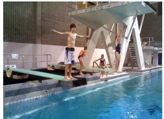
Two of the hearing impaired divers trying out the programme in Brisbane. Neither had any previous experience and all the kids had a great time.